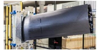
Daher – Shap'In