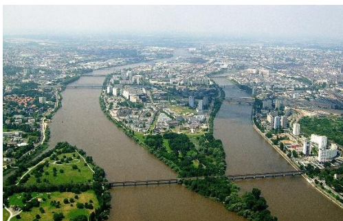
The Loire River in Nantes

Welcome to Nantes, located on the banks of the Loire river, 50km from the Atlantic Coast. Nantes metropolitan area represents over 1 million inhabitants (2022). An industrial city which 19 th century shipyards inspired Jules Verne, the science-fiction novelist, who grew up in Nantes.