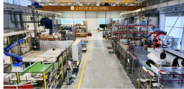
IRT Jules Verne